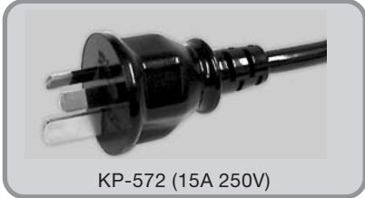
KP-572 (15A 250V)