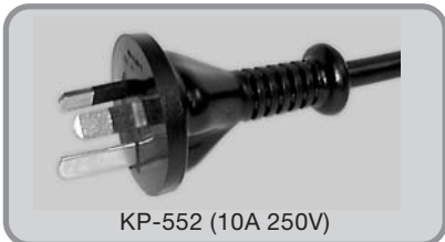
KP-552 (10A 250V)