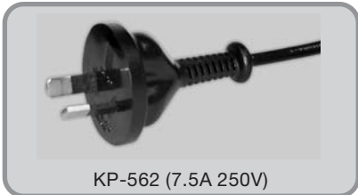
KP-562 (7.5A 250V)