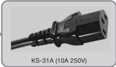
KS-31A (10A 250V)