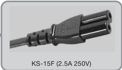
KS-15F (2.5A 250V)