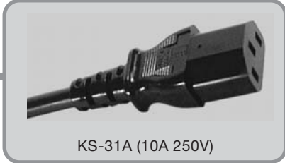
KS-31A (10A 250V)