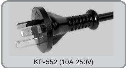
KP-552 (10A 250V)