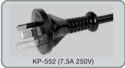
KP-552 (7.5A 250V)

Heavy and Light Duty Household Appliance, Office Equipment, etc.